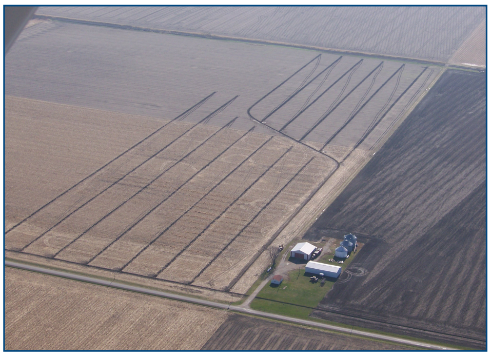
Tile drainage projects are widespread in Illinois.

The old saying goes "You pay for tile whether you write a check or not!" With today's rising farmland values - - those extra bushels per acre are magic! Farmers, landowners, investors alike are seeing an opportunity to enhance their net profits by installing drainage tile that systematically drains problem wet areas and create higher corn and soybean yields. The return on their investment is great - - and the Internal Revenue Service lets you deduct the tile expenses quickly verses the old long term depreciation schedules. Lots of activity in the countryside.