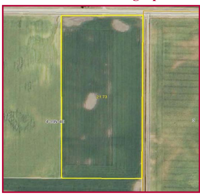
Aerial photograph was provided by the AgriData. Inc.