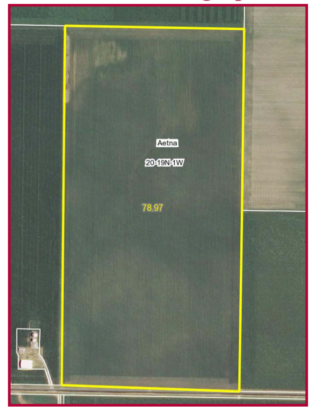
This aerial photograph was provided by AgriData, Inc.