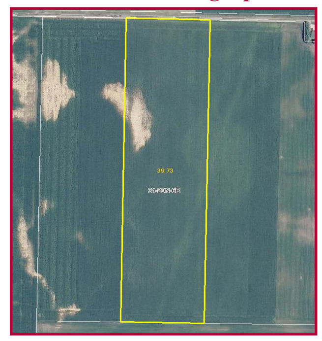
This aerial photograph was provided by AgriData, Inc.