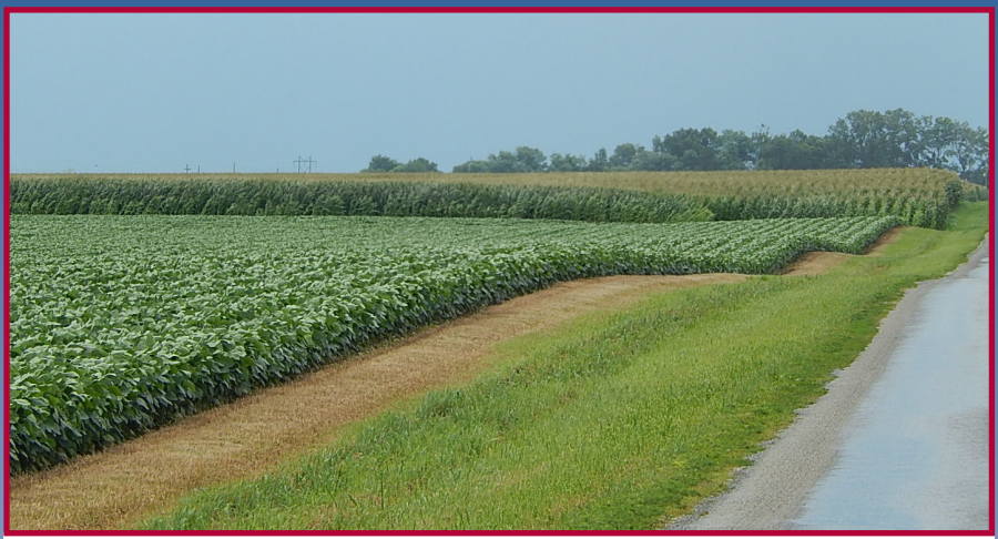
This photograph is taken facing east along the road which forms the south boundary of the farm.