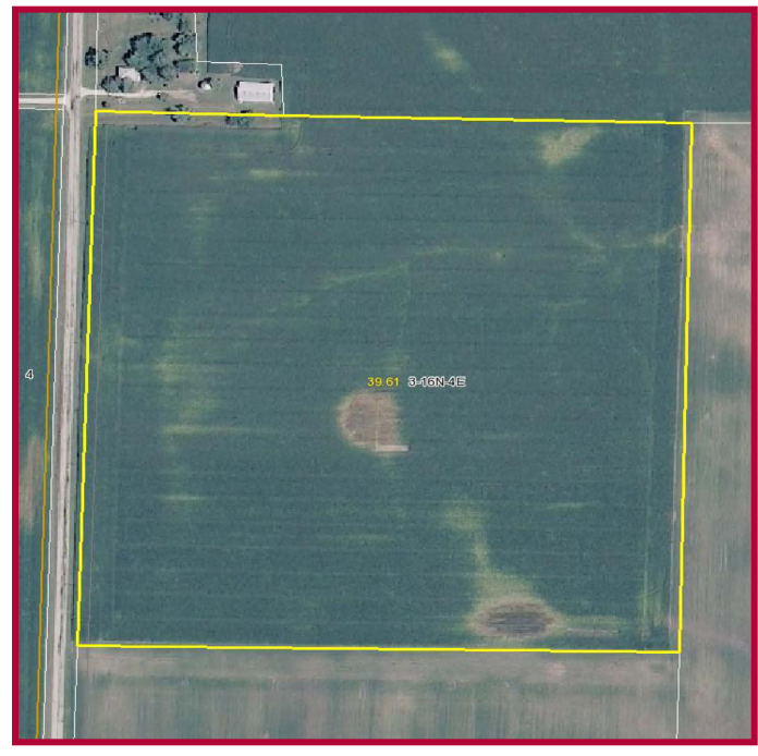
This aerial photograph was provided by AgriData, Inc.