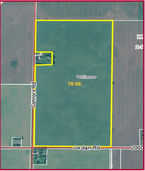
Aerial photograph was provided by the AgriData. Inc.