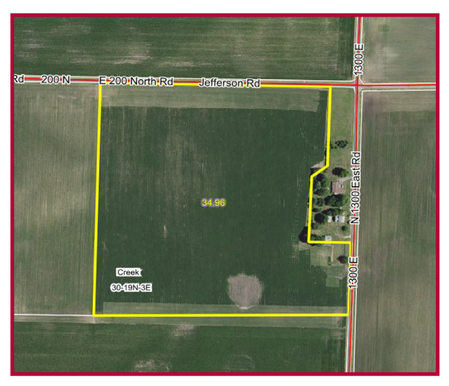
Aerial photograph was provided by the AgriData. Inc.