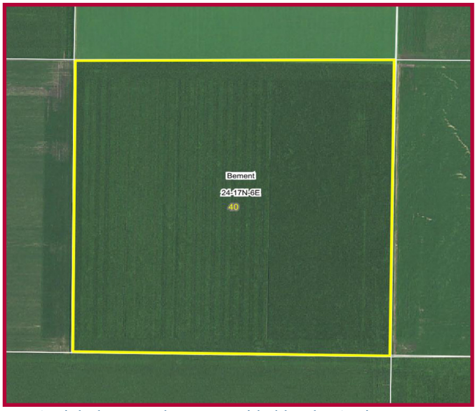
Aerial photograph was provided by the AgriData. Inc.