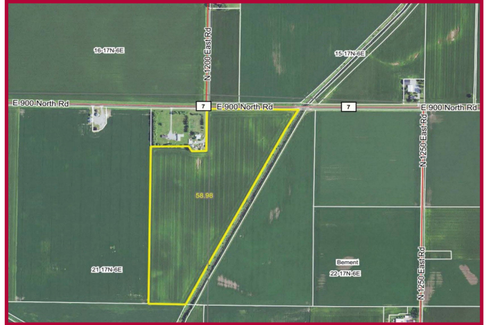
Aerial photograph was provided by AgriData, Inc.