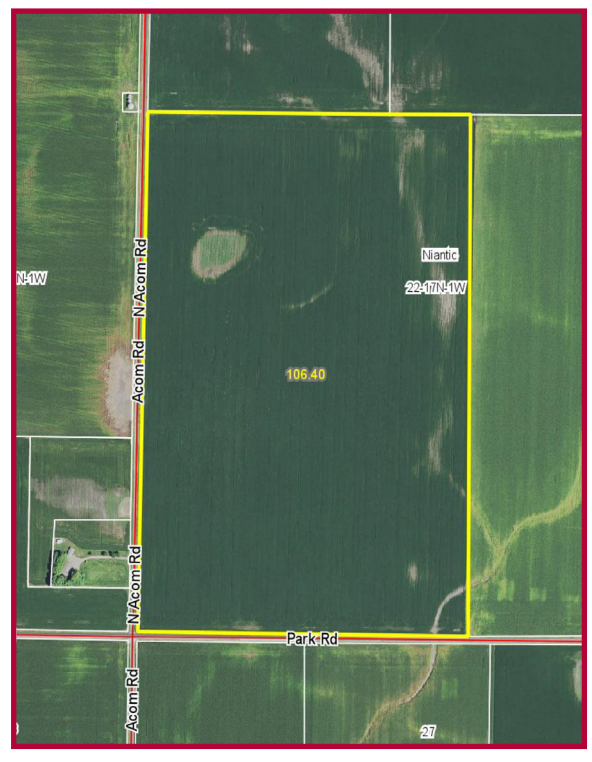
Aerial photograph was provided by the AgriData. Inc.