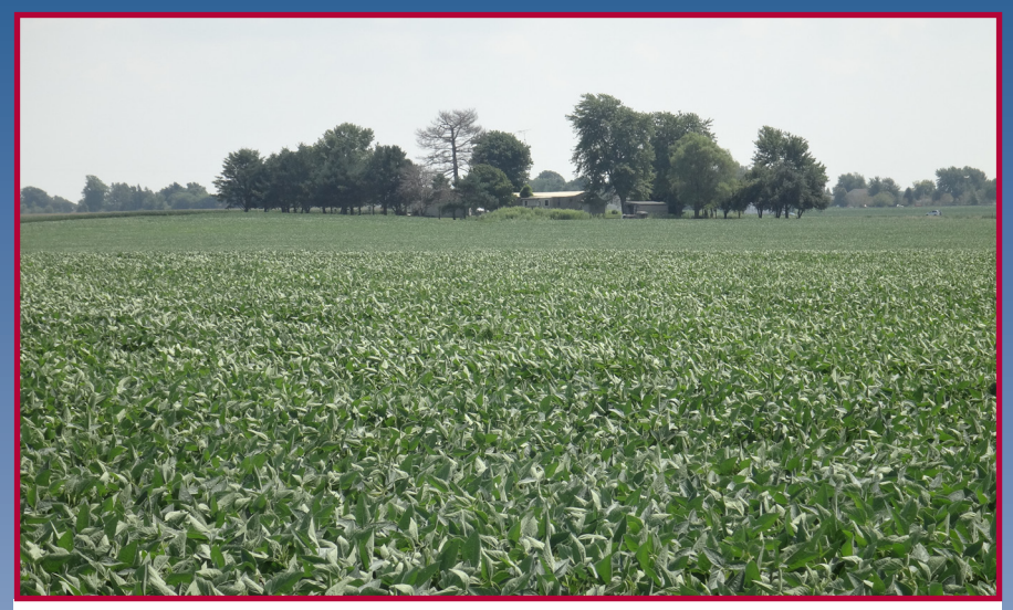
This photograph faces south across the farm from the northwest corner (Latham is in the background).