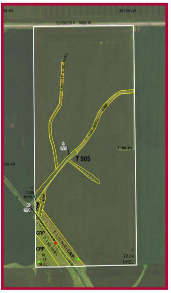
Aerial photograph was provided by Logan County FSA