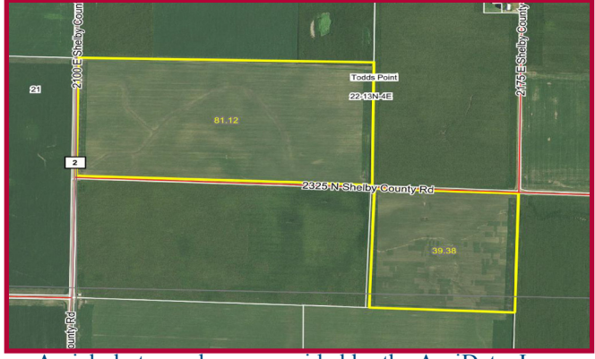
Aerial photograph was provided by the AgriData. Inc.