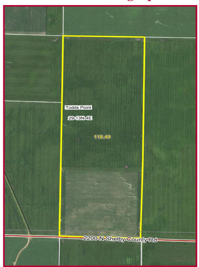
Aerial photograph was provided by the AgriData. Inc.