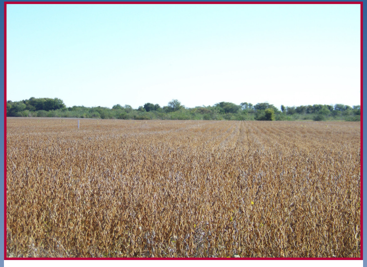
This photograph shows the south part of the farm (facing to the east).