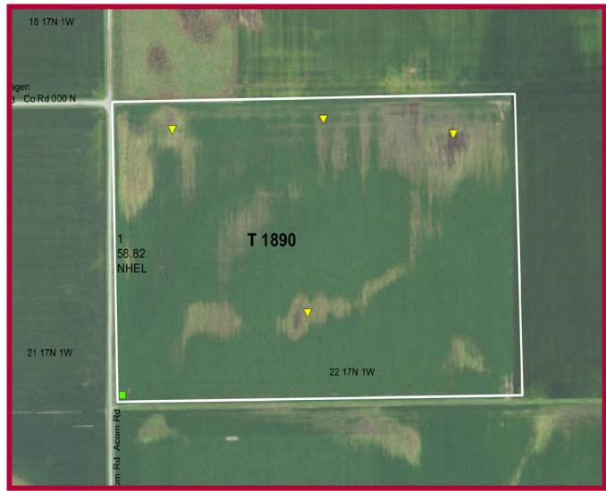
Aerial photograph was provided by the Macon County FSA.