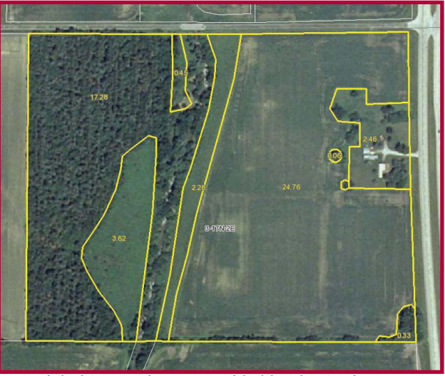
Aerial photograph was provided by the AgriData. Inc.