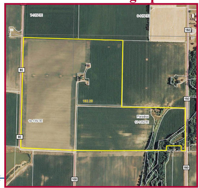
Aerial photographs provided by AgriData. Inc.