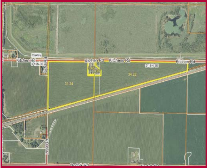
Aerial photograph was provided by the Macon County FSA.