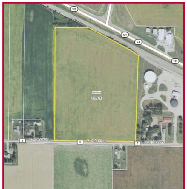
Aerial photograph was provided by Agri Data.