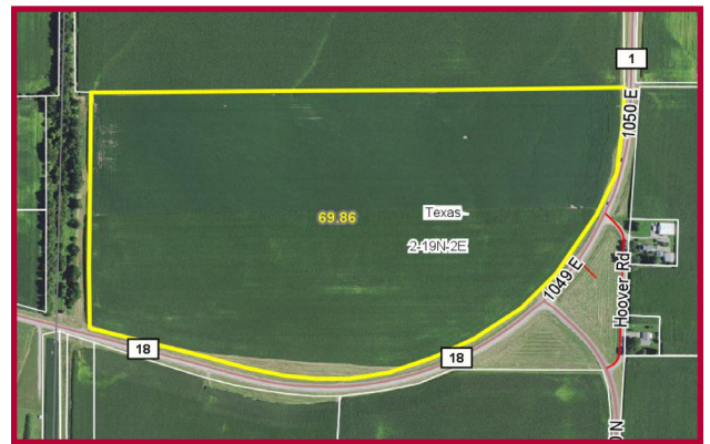
Aerial photograph was provided by the AgriData, Inc.