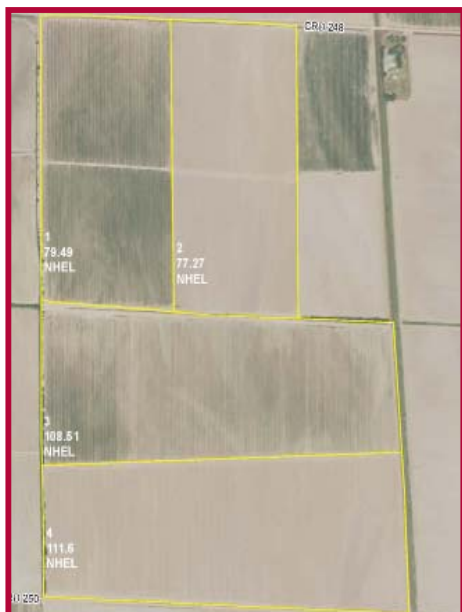
Aerial photograph was provided by the New Madrid County FSA.